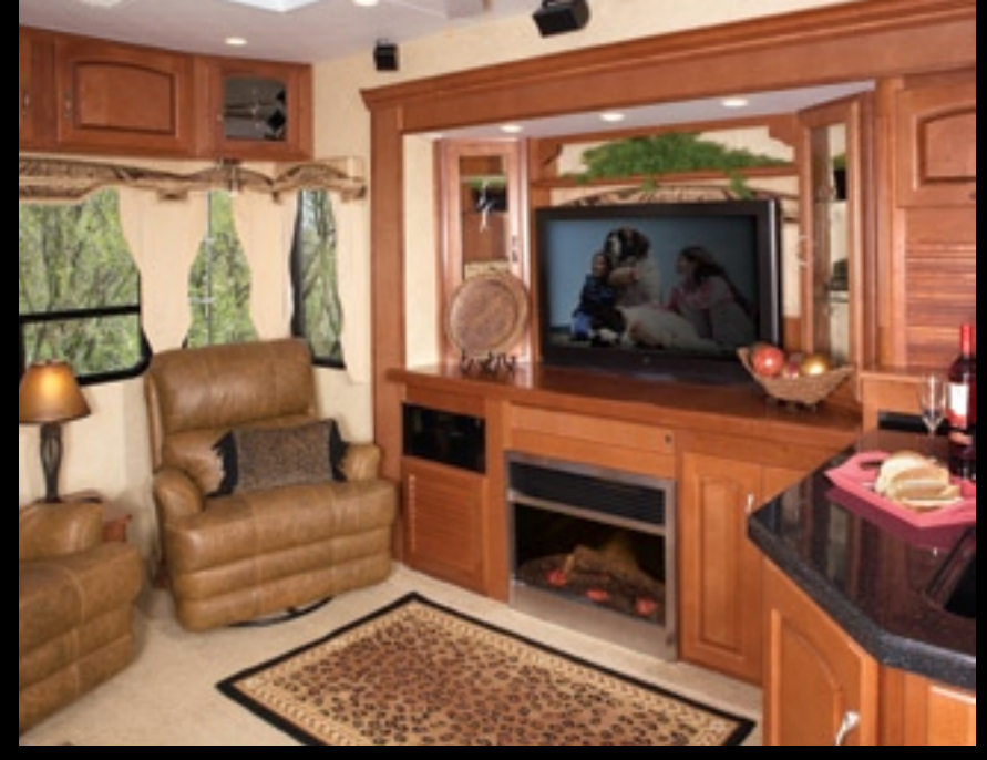
The 35GKE and 36GKE feature a standard 42" auto-lift HD LCD television.