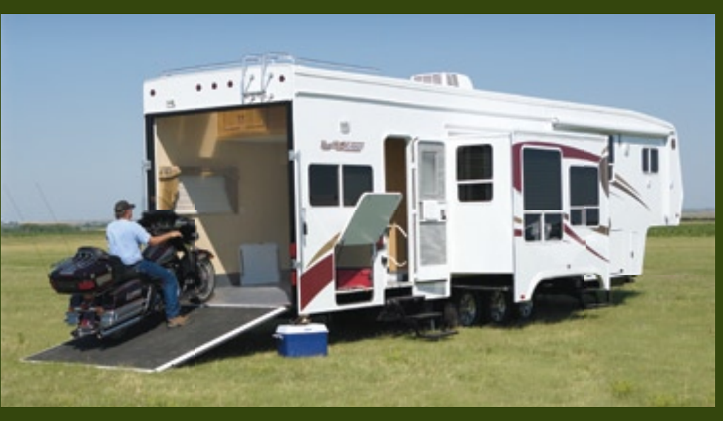
Rear garage entry or optional side entry gives the flexibility needed to load a variety of cargo.

Wind down in an interior designed for relaxing, with roomy slide-outs in the kitchen and living areas, and comfortable master suite with a queen-sized bed and enclosed bath. A double-sized loft bed above the cargo area, and optional electric lift bunks in the garage provide plenty of room for friends and family. Other Excel features rarely found in other SURVs are the standard Eurochair/recliner, optional washer/dryer in the bathroom, and innovative hinged 32" HD LCD television that allows for viewing in either the living area or garage! Every inch of Excel's new Wild Cargo is geared toward your fun-loving and action-packed lifestyle.